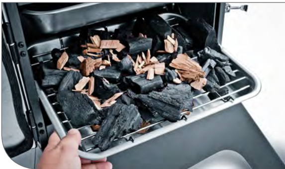
HEAVY-DUTY CHARCOAL TRAY