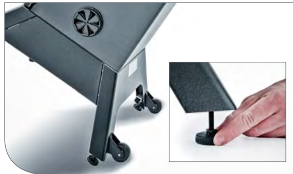
LEG LEVELERS AND WHEELS