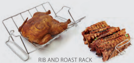
RIB AND ROAST RACK