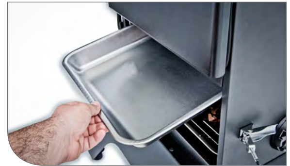
STAINLESS STEEL WATER PAN