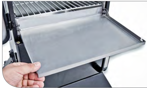
FOLD-DOWN DRIP TRAY